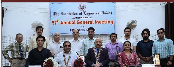
Newly elected Committee Members 2024 – 2026