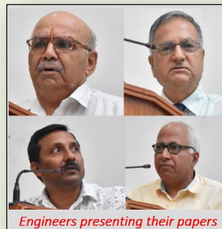
Engineers presenting their papers